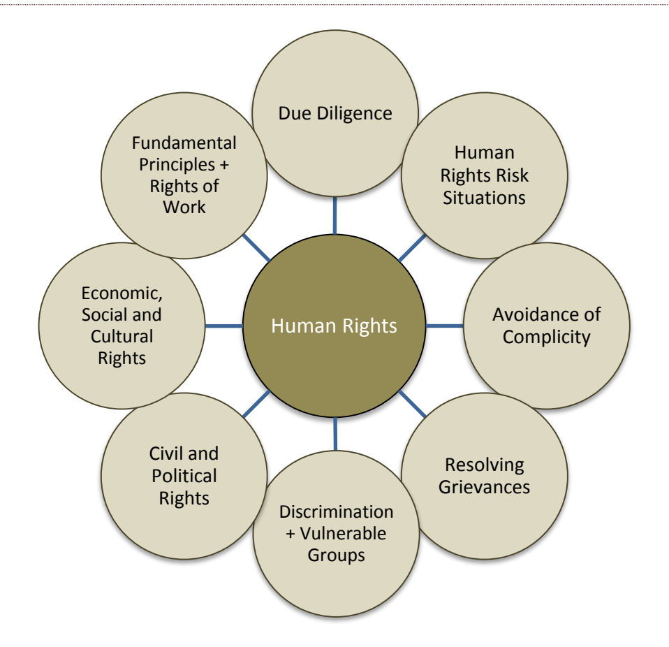
Figure 4: The core subject of 'Human Rights' with the eight associated key issues