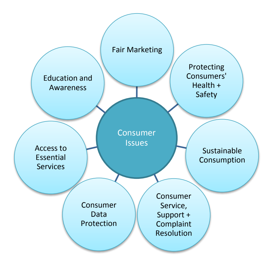
Figure 8: The core subject 'Consumer Issues' with the associated seven key issues