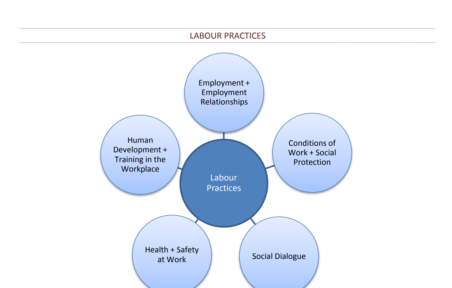
Figure 5: The core subject 'Labour Practices' with the five associated key issues