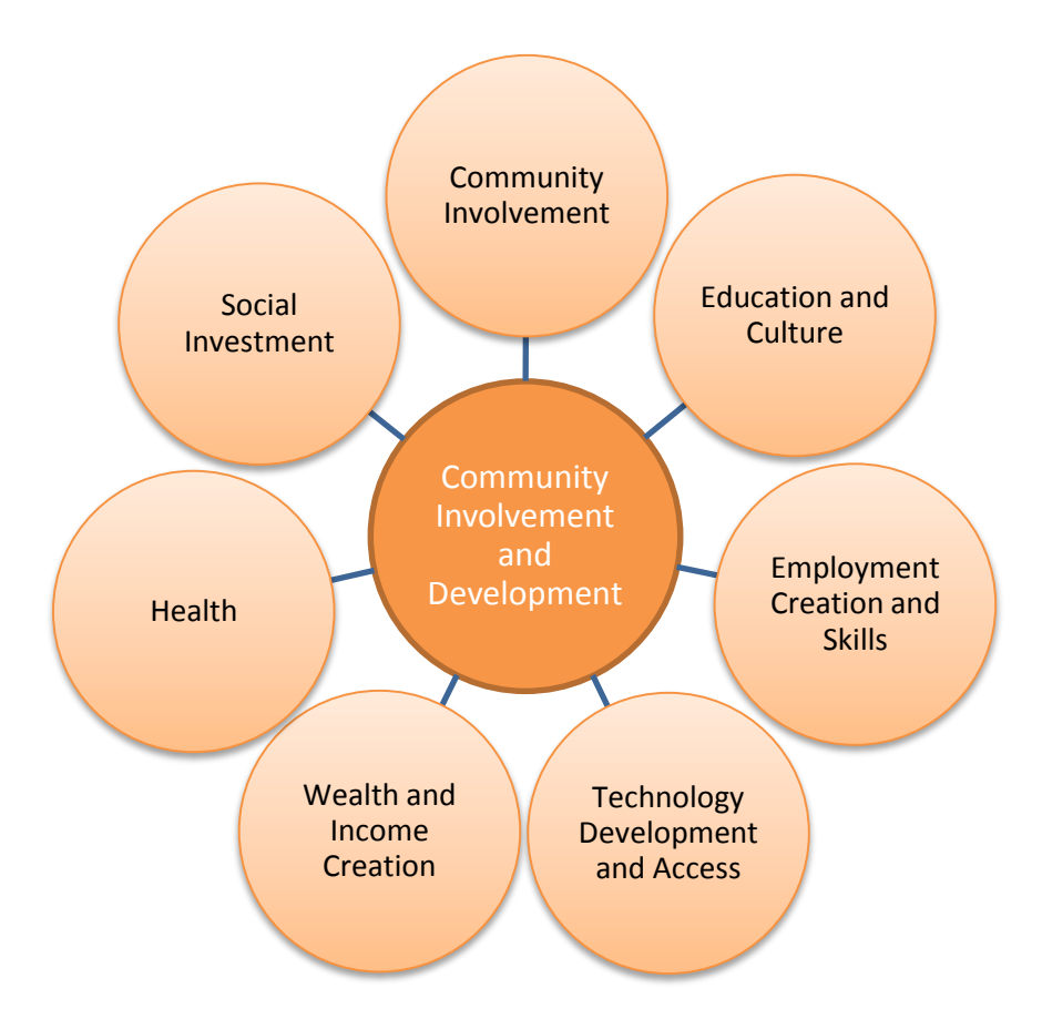
Figure 9: The core subject 'Community Involvement and Development' with the seven associated key issues