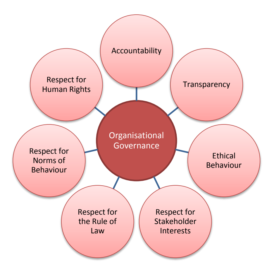
Figure 3: The core subject 'Organisational Governance' with the seven associated key issues/key principles