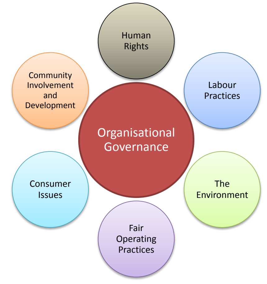
Figure 2: The seven core subjects of ISO 26000

From the issue matrix it is then possible to identify a sub-set of relevant issues for your organisation to take forward. A summary of the Agrico UK self-assessment/issue matrix can be found in this section.