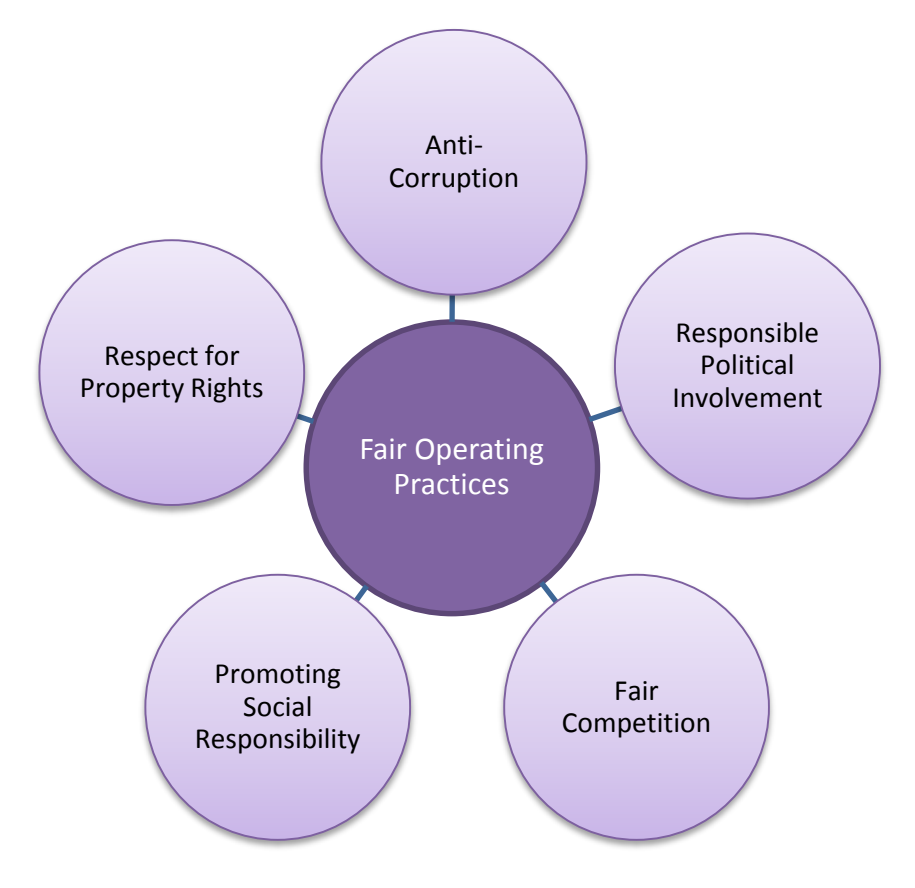
Figure 7: The core subject 'Fair Operating Practices' with the five associated key issues